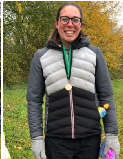
All finished and didn't they do well