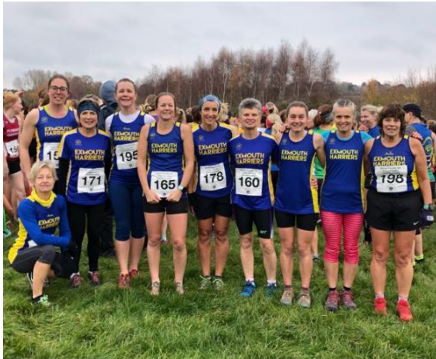
Ready for action at the Westward League & Devon XC Champs. at Exeter