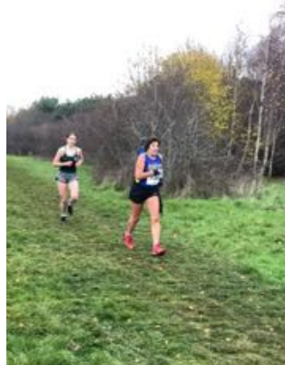
Harriers in action at Exeter XC