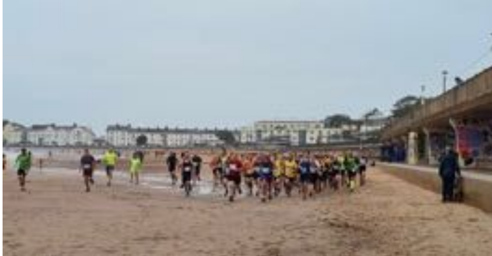
And they're off towards Orcombe Point