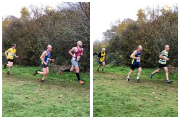
Harriers pushing through the field