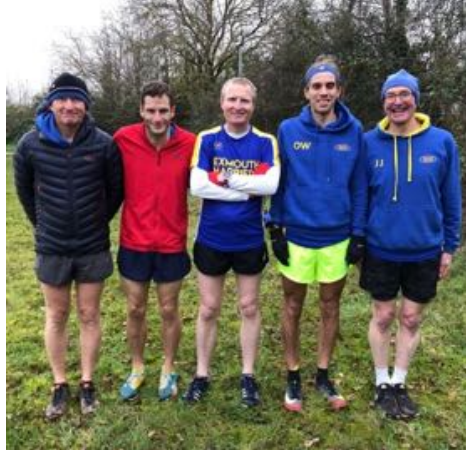
All present & correct before the XC at Exeter Arena