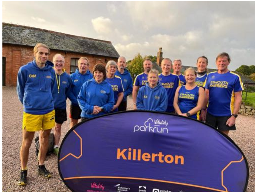
Almost all of the 17 Harriers before the start at Killerton parkrun