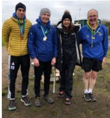
Who's that photo-bombing the Harriers Men's team after the race