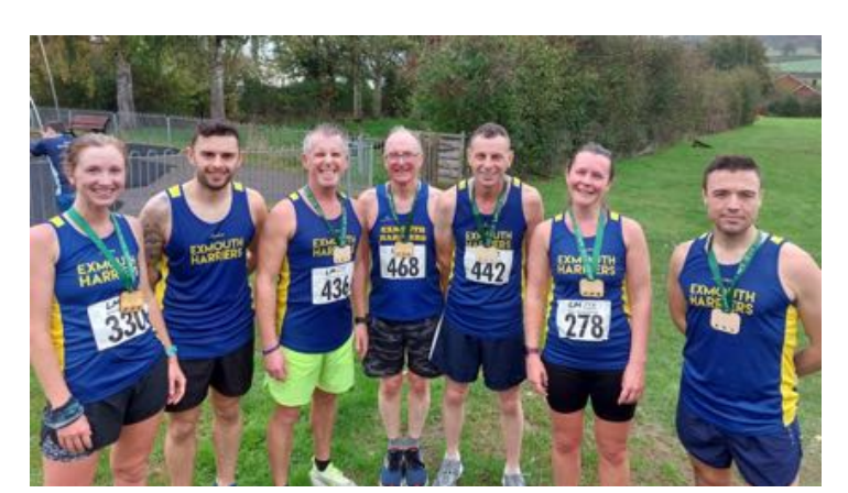
Harriers after the Sidmouth 10km

9<sup>th</sup> November 2022 (The next edition is due out on Wednesday 23rd November)