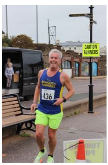
A few action photos from the Sidmouth 10km