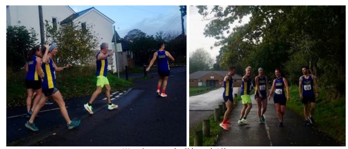
Warming up at the Sidmouth 10km