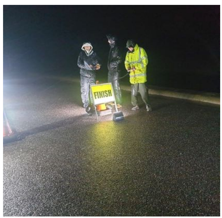
City Runs volunteers at the Exmouth "Seafront 2.5 Miles"