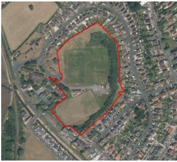
Aerial view of the Warren View Sports Ground in Halsdon Avenue, Exmouth where the Exmouth SportsHub could be built in the next few years