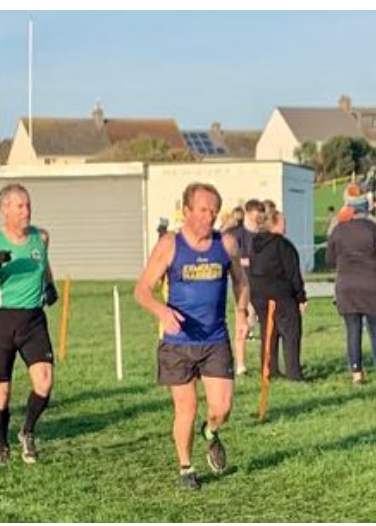
Action photos from the Westward League XC in Newquay