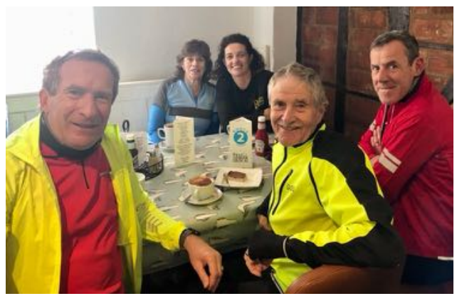
Ray's "Harriers recovery cycling team" at Route2 Café in Topsham