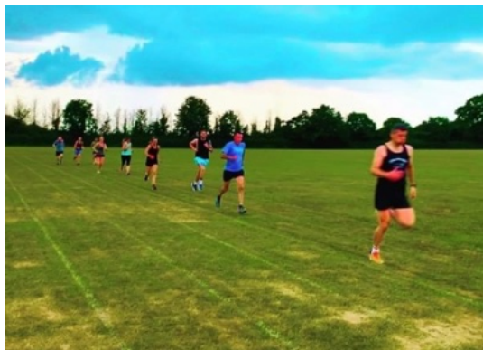
Recent training sessions at St Peters School track