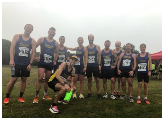
.... and looking a bit bedraggled after the finish but still smiling!