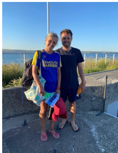
Before the big start of the 100km at Weymouth