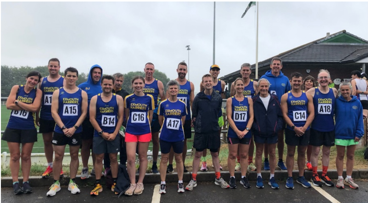
Ready for the start of the Erme Valley Relays

(The next edition is due out on Wednesday 19th July 2023)