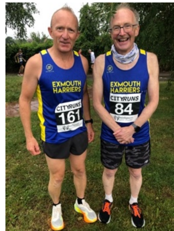
Most of the Harriers smiling before the start of the Run Exe 5km .....