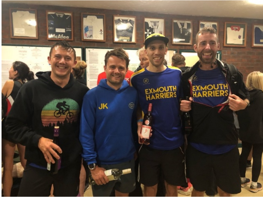
More smiles from the Mens team after the relays with their 2nd place “trophy”