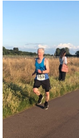
Harriers at City Runs Exeter 10km