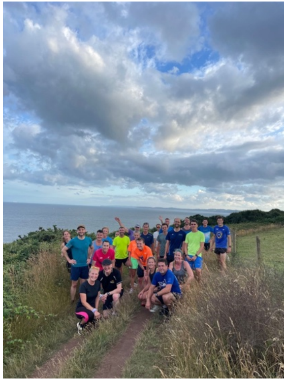
A recent Harriers beach & coastal path training session