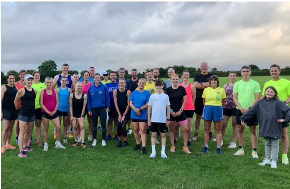
Harriers fantastic “Sports Day” training session at St Peters School 18/07/23

(The next edition is due out on Wednesday 2nd August 2023)