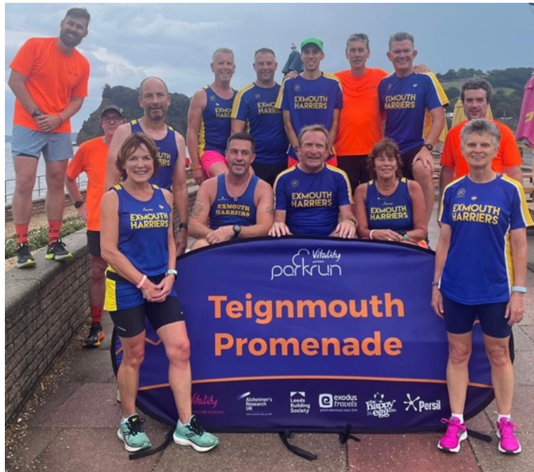
Harriers with a few Jog On friends “parkrun Touring” at the Teignmouth Promenade event