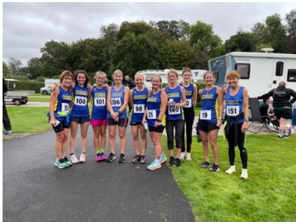
Before and After the Newton Abbot Ladies 10km