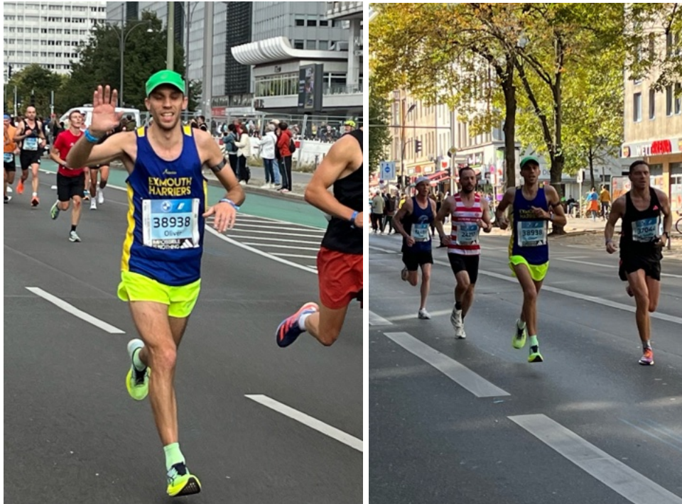
Oli at 11km and 37km