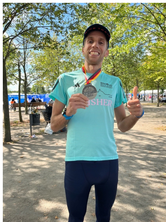
Oli pleased to finish in a new pb