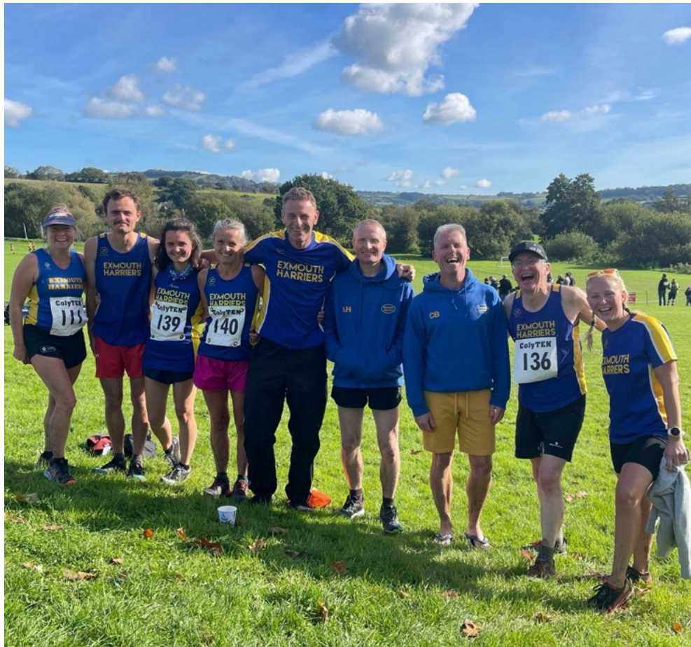
All smiles before the start of the ColyTen