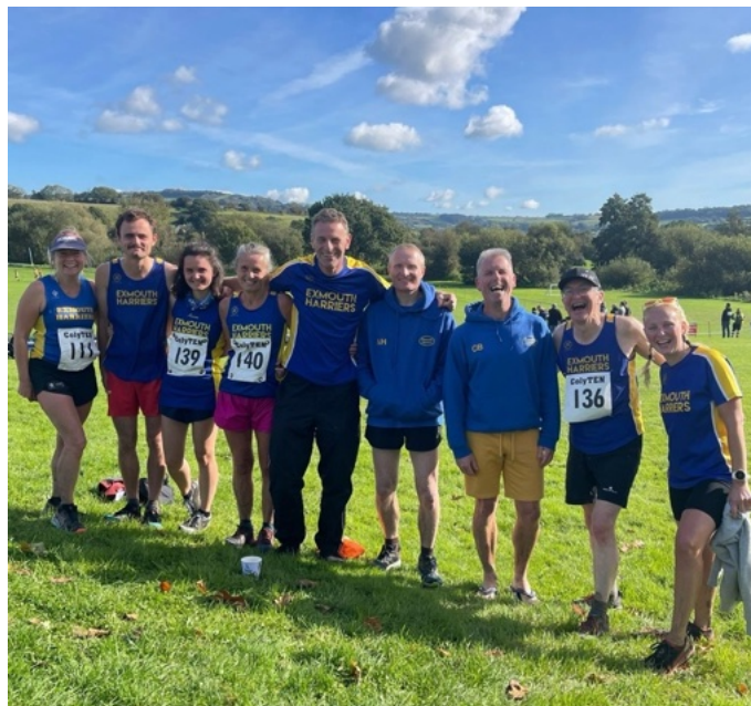
Harriers at the ColyTen

(The next edition is due out on Wednesday 8th November 2023)