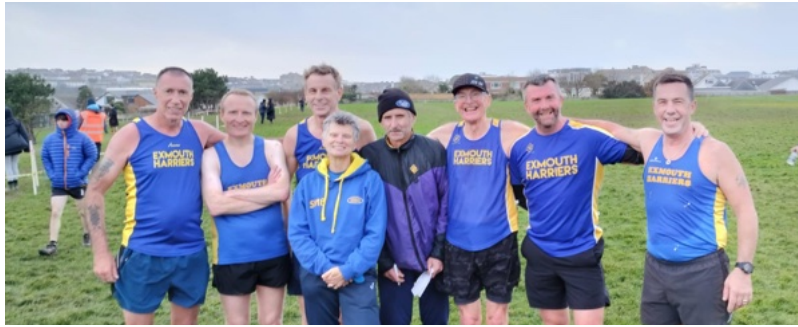
Harriers ready for XC action in Newquay