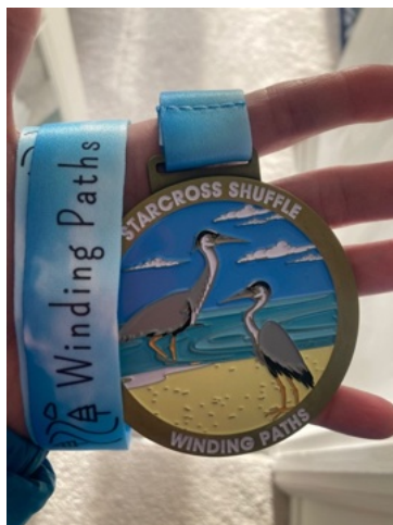
Harriet's Starcross Shuffle medal

Harriet Lyons ran in this unique event hosted by Winding Paths, it started at Starcross and the picturesque route followed the Exe Estuary alongside the grounds of Powderham Castle then headed along the Exe Estuary Trail past the Turf Lock Hotel to the turn around point at mile 3.3 and headed back to the Starcross HQ. The runners had 7 hours to run as many of the 6.6 mile laps as they wanted to achieve their chosen distance. Harriet was really pleased to finish 4 laps which was just over 26 miles in 4 hours 11 minutes and 4 seconds.