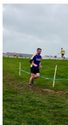
Harriers in action in Newquay