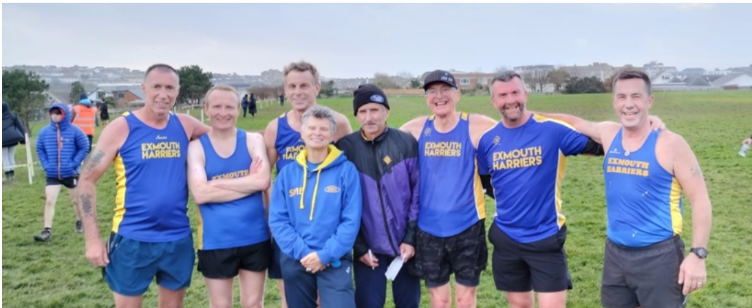
Harriers at the Westward League XC in Newquay

(The next edition is due out on Wednesday 6th December 2023)