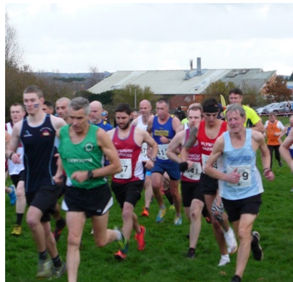
"Sprinting" at the start