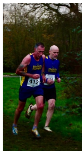
Still going strong