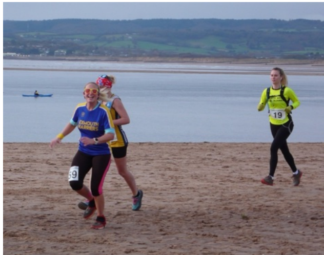
Harriers in the 1st mile on the beach