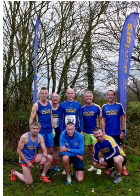
Harriers at the Westward League XC & Devon County AA XC Champs. in Exeter