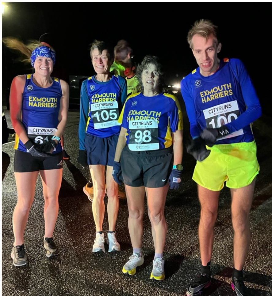
Battered by the wind just minutes before the start