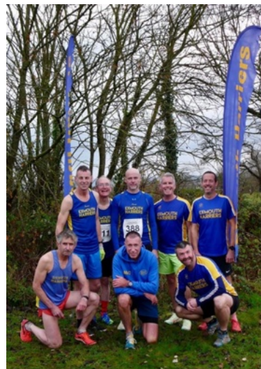
Harriers at Exhibition Fields, Exeter