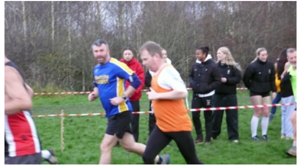
A mad dash at the start