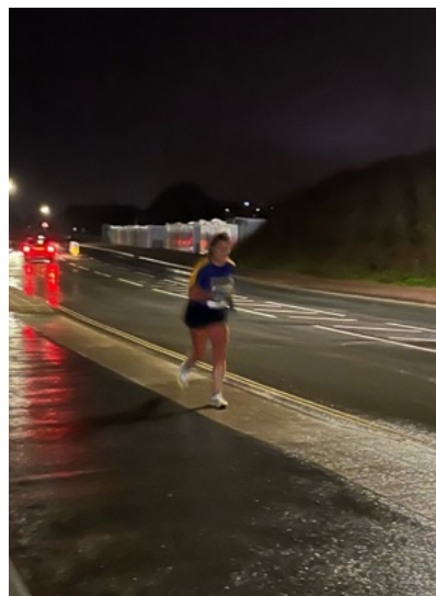
Challenging conditions for all concerned