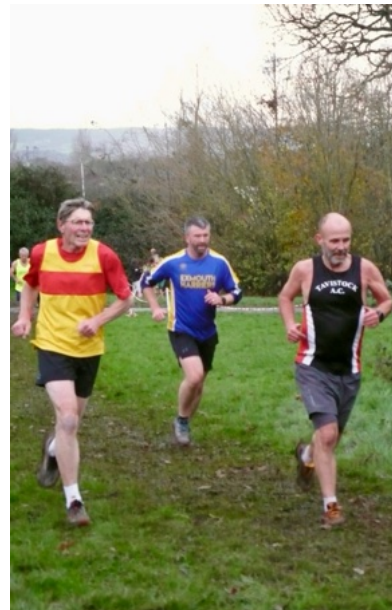
The course starting to churn up