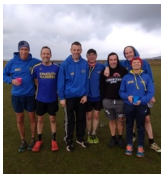
Harriers "Magnificent 7" at Westward Ho!