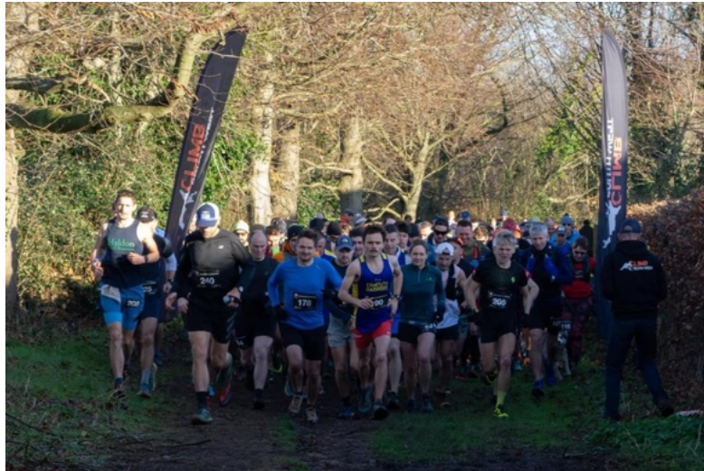
They're off .....