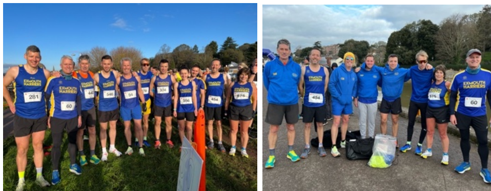
Harriers before & After the 1st Chance 10km