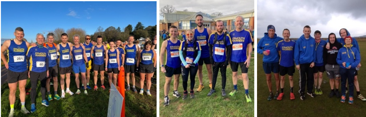
Harriers ready for action at the 1st Chance 10k, Oh My Obelisk! and the Westward Ho! XC

(The next edition is due out on Wednesday 31st January 2024)