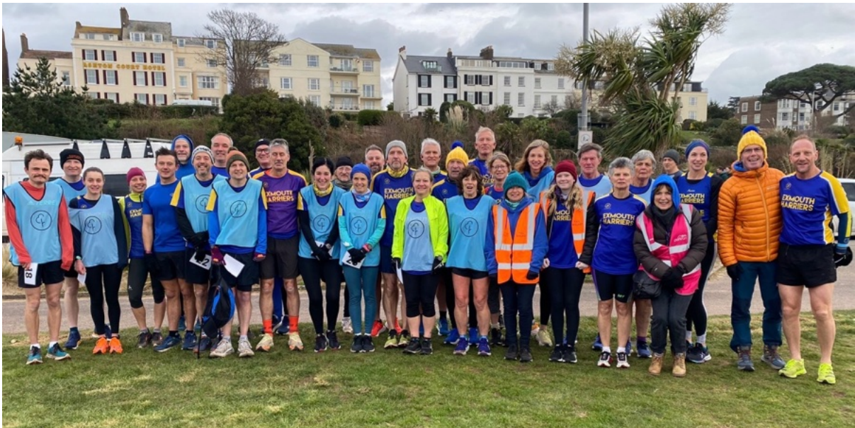
Harriers about to do “a bit of pacing” at the Exmouth parkrun on 20th January

(The next edition is due out on Wednesday 14th February 2024)