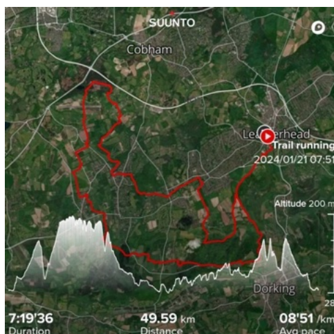
The route and elevation of the Winter Tanners 30 Mile Challenge in Surrey