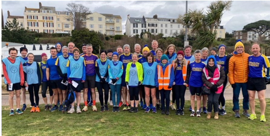
Almost all of the club turned out – well done Harriers