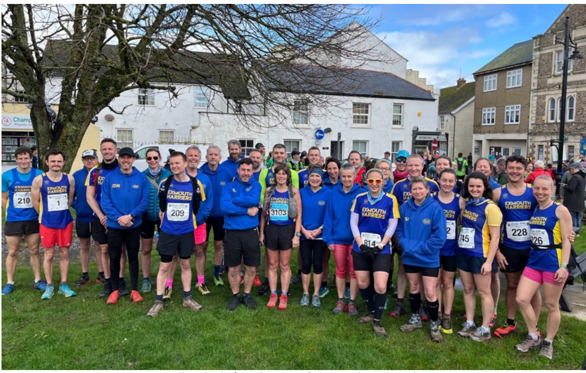
All smiles before the start of The Grizzly & The Cub