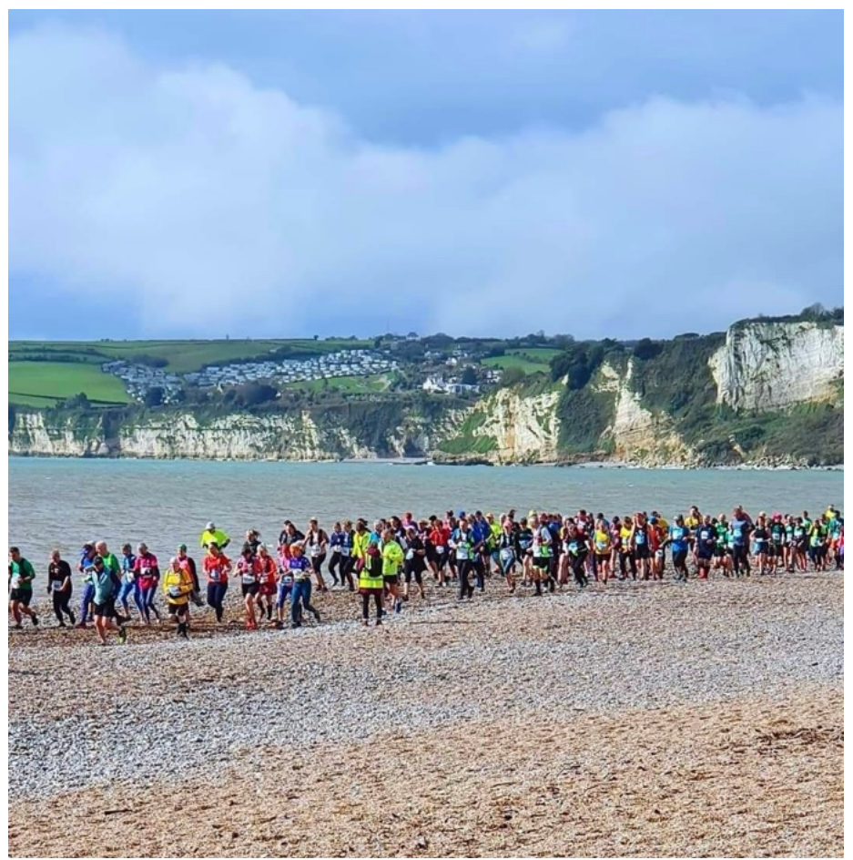
Don't look over your shoulder as that's where you will be running soon!