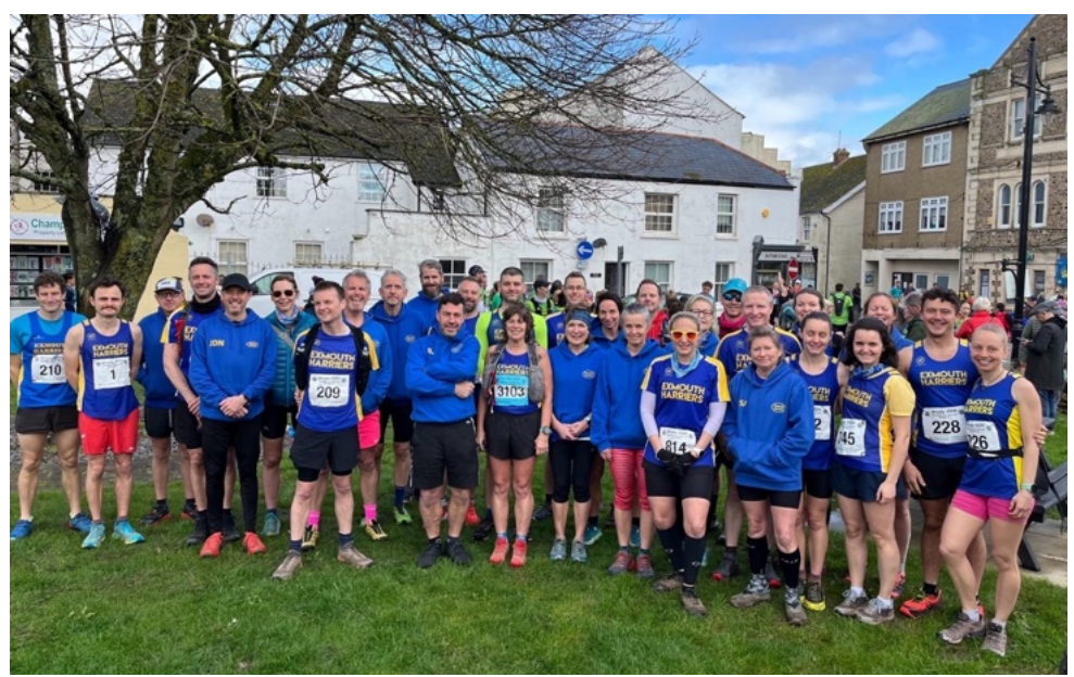
Harriers before the start of the Grizzly / Cub in Seaton