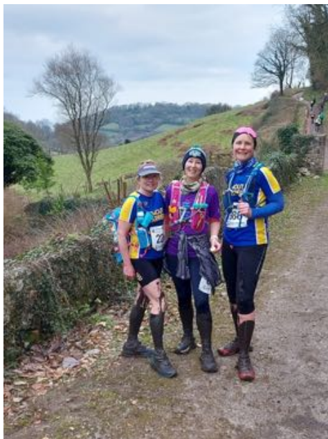
Taking a short breather?