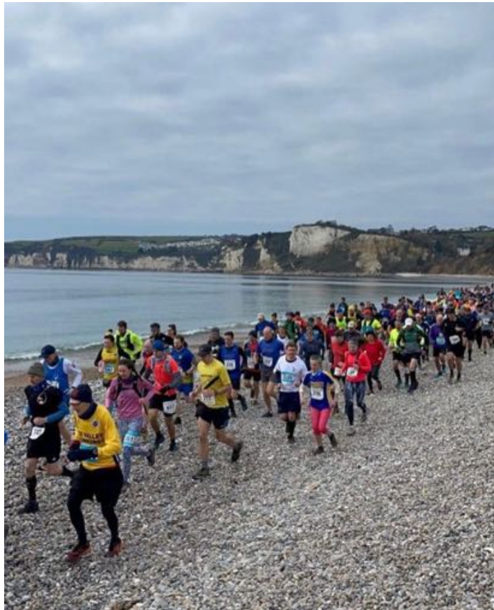
The 1st mile on the pebbles