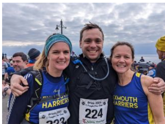
Ready for the "off"