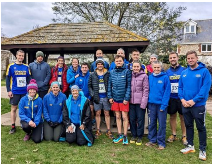
All smiles from the Harriers before The Grizzly and The Cub

(The next regular edition is due out on Wednesday 15th March 2023)