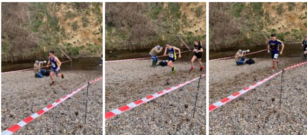
Another pebble section