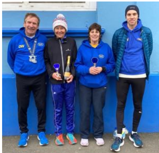
Trophies on show after the Bideford ½ Marathon