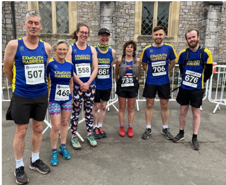
Harriers before the start of the Power Runs at Powderham

(The next edition is due out on Wednesday 24th April 2024)