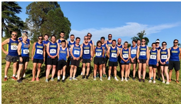
Harriers at the 2022 Woodland Relay at Escot Park

For many years East Devon Clubs have organised some fun family events called the Woodland Relay in the Summer (apart from Covid in 2020 and in 2023). Its normally, Axe Valley Runners, Sidmouth Running Club, Honiton Running Club and Exmouth Harriers who organise these in turn. Honiton RC organised the last event at Escot Park in 2022 and you can see the results here https://www.axevalleyrunners.org.uk/woodland-relays/ and in the photo below how many Harriers enjoyed themselves on a lovely warm evening in June. It's Exmouth Harriers turn to host the next event in 2024, we are currently working on a suitable date (maybe Wed. 19th June) and venue, we will need a lot of help from all club members to put this on so please don't be shy in coming forward to assist, every little helps!