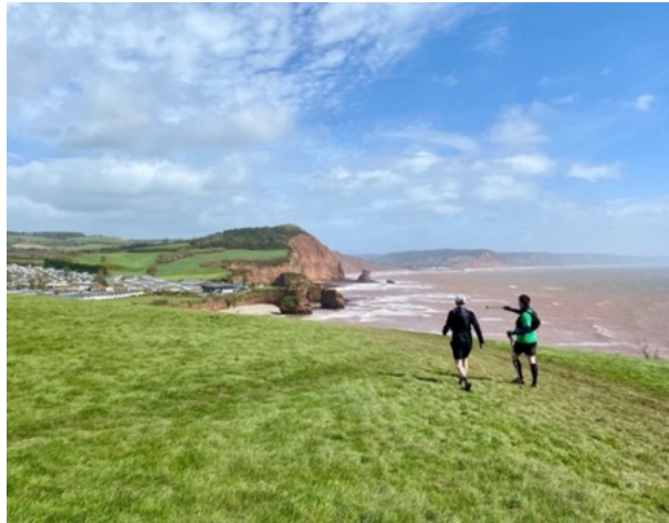
Looks a nice day for a coastal path trek