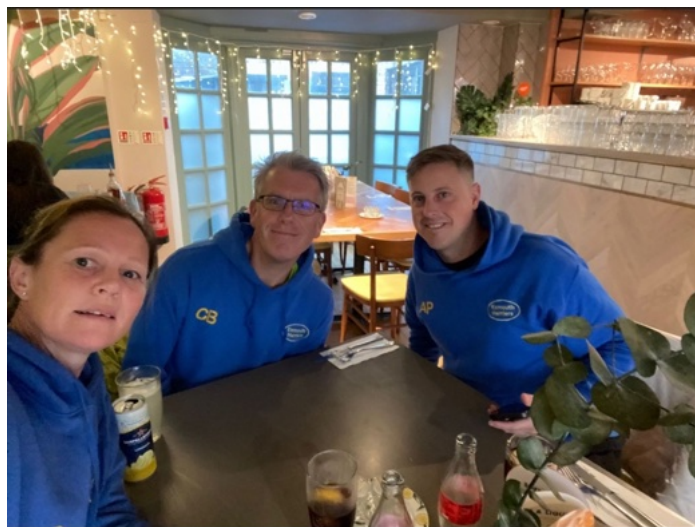
Getting the carbs & hydration levels topped up