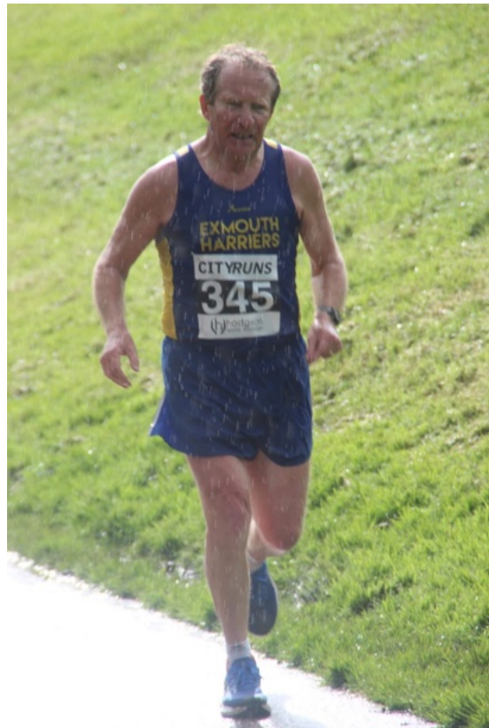
Not so nice conditions – the grey clouds and pouring rain came in later on