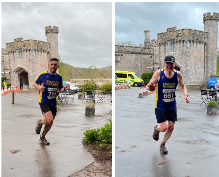
Starting the 2nd lap after the heavy shower