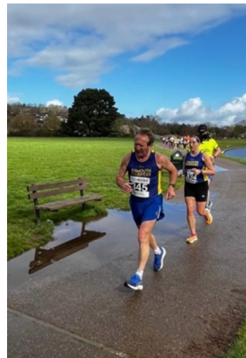
Nice conditions – blue sky & sunshine .....