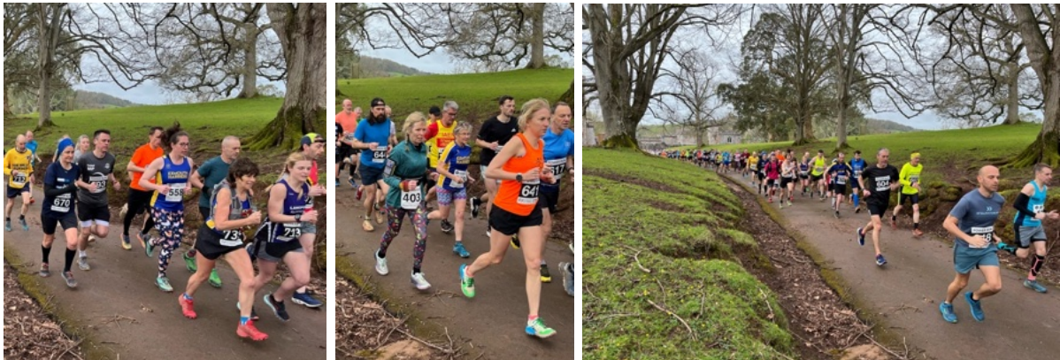
A nice uphill start