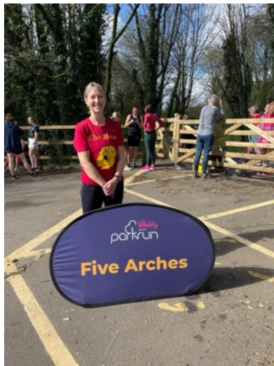
Dawn at Five Arches parkrun