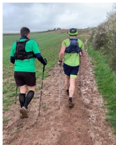
Which way next?